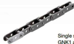
Single strand with GNK1 attachment every link

The GNK1 attachment indicates a chain with a bolt hole drilled into the center of the link plates on both sides of the chain.