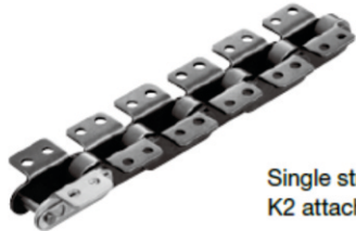
Single strand with K2 attachment every link

A K attachment has a bent link plate that extends out on both sides of the chain. The attachment comes with one or two bolt holes and is designated as K1 or K2, respectively