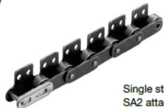
Single strand with SA2 attachment every link

With an SA attachment, the link plate is extended vertically on one side of the chain. The attachment comes with one or two bolt holes and is designated as SA1 or SA2, respectively