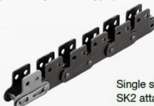
Single strand with SK2 attachment every link

With an SK attachment, the link plate is extended vertically on both sides of the chain. The attachment comes with one or two bolt holes and is designated as SK1 or SK2, respectively (SK1 only for RS type).