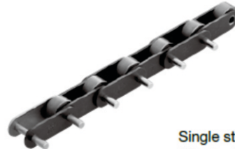
Single strand with EP attachment every link

One end of the pins is extended on one side of the chain.