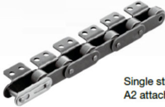
Single strand with A2 attachment every link

An A attachment has a bent link plate that extends out on one side of the chain, forming an L-shape. The attachment comes with one or two bolt holes and is designated as A1 or A2, respectively